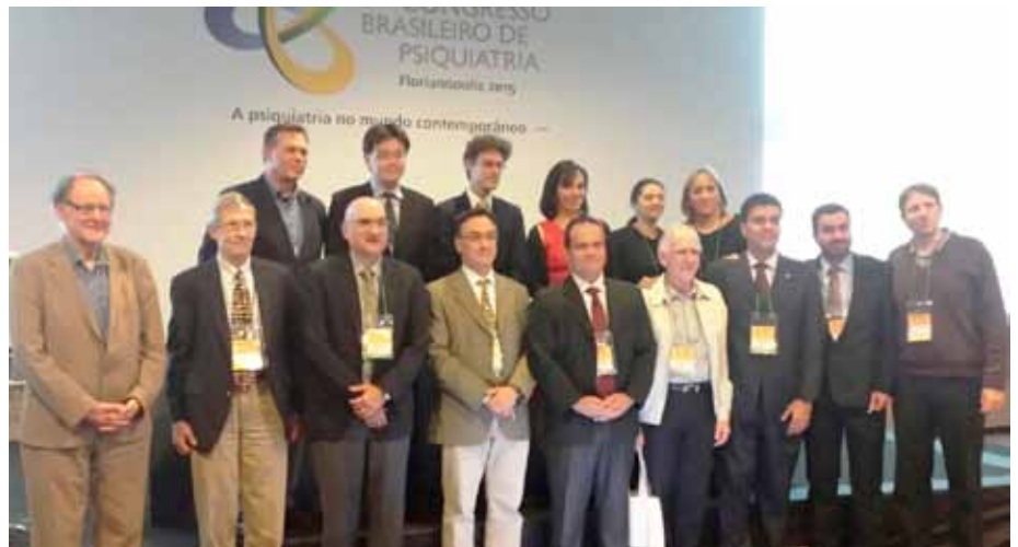
Members of the Section on Religion, Spirituality and Psychiatry at the 1st Global Meeting on Spirituality and Mental Health held in Florianopolis, Brazil from 5-6 November 2015.

The 2nd Global Meeting on Spirituality and Mental Health is planned to occur during the WPA International Congress in