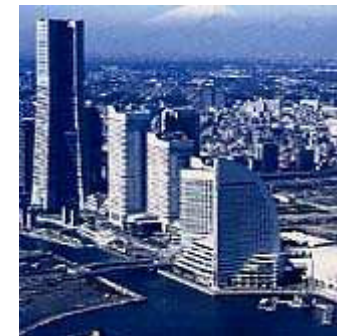
Yokohama, Japan, site of the XII WCP

Recently, a preliminary report of the XI World Congress of Psychiatry that took place in Hamburg, Germany, on August 6-11, 1999 was issued by its organizers. It shows that over 8,000 registrants from 117 different countries participated in 583 scientific sessions. Particularly appreciated were the debates and symposia. Among the highlights of the Congress were a thoughtful review of historical and ethical issues, and a Fellowship program, which selected 121 young psychiatrists from 73 different countries and offered them a focused scientific and social track. Now we are planning the XII World Congress of Psychiatry, which will take place in Yokohama (see adjacent photo), across the Tokyo Bay, on August 24-29, 2002. Under the overall theme Partnership for Mental Health, this will be the first World Congress of Psychiatry to meet in Asia, where half of mankind lives. The event will coincide with the 100th anniversary of the foundation of the host organizer, the Japanese Society of Psychiatry and Neurology.