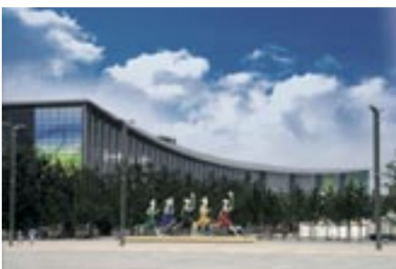
The Congress venue - China National Convention Center (CNCC).