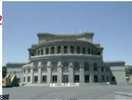
25 28 The Opera House on the Liberty Square.