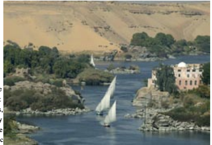
The River Nile in Aswan.

2011 People with mental disorders are at increased risk for several physical diseases and have a higher mortality for natural causes than the general population. Their access to physical health