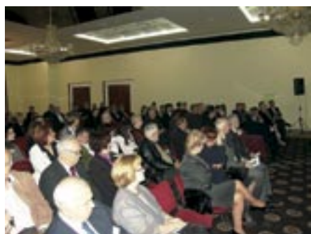
A section of the participants at the First Symposium on Alcoholology.

held on 23-24 April 2010 at the Hotel Tuzla in Tuzla, Bosnia and Herzegovina. The co-organizers were the Institute for Alcoholism and other Addictions of Sarajevo Canton, the Department of Psychiatry of the University Hospital "Sestre Milosrdnice" (Zagreb, Croatia), the Association of Trainees and Young Psychiatrists/Neuropsychiatrist from Bosnia and Herzegovina, the Community Clubs of Treated Alcoholics of Serbia, the Croatian Association for Alcoholism and other Addictions of Croatian Medical Association and Reference Center for Alcoholism of the Ministry of Health and Social Welfare of the Republic of Croatia.