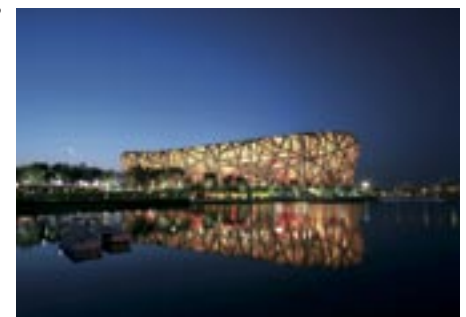
Bird's Nest Stadium, where the 2008 Olympic Games was held.