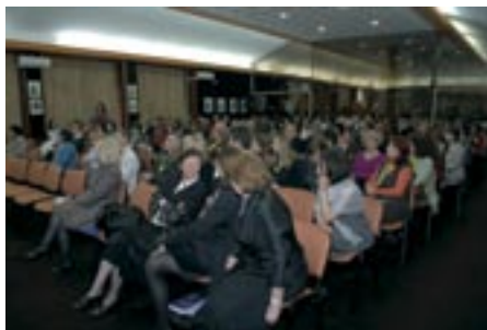
Plenary session at the II Congress of DEAPS, Zlatibor, Serbia, April 22-25, 2010.

The Association for Child and Adolescent Psychiatry and Allied Professions of Serbia (DEAPS) was formed in 2004 in Belgrade and it is recognized and accepted by the international organizations such as IACAPAP (International Association for Child and Adolescent Psychiatry and Allied Professions) and ESCAP (European Society for Child and Adolescent Psychiatry). The WPA Section on Children and Adolescent Psychiatry actively supports DEAPS as well.