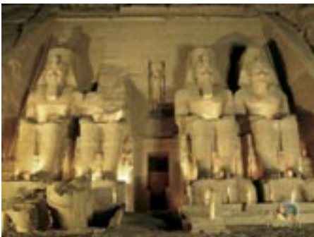
Abou Simbel Temple in upper Egypt.

One of the main caveats of our current psychiatric classifications is the high prevalence of co-occurrence of psychiatric disorders because of the overlap of symptoms and blurring of delineation of disorders. What is more alarming is the high co-morbidity between physical and mental disorders. Recent studies revealed that the prevalence of cardiovascular, cerebrovascular, diabetes, hyperlipidaemia, emphysema, etc ... are commoner in mental patients than in the general population. Our patients may have high threshold for pain and so many painful physical disorders are