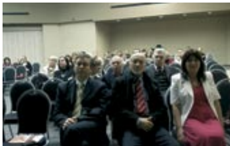
A section of the participants at the Psychiatry Days meeting.

The Annual Meeting of the Psychiatric Association of Bosnia-Herzegovina, entitled the Tenth Psychiatry Days Teslić 2010 was held on 26-27 March 2010 in Banja Vruć