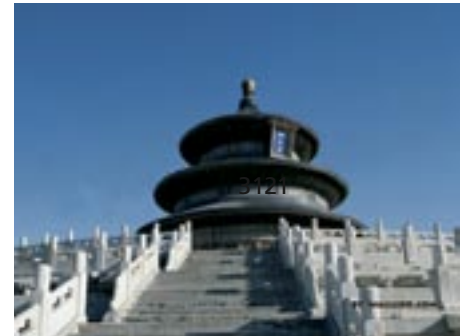
The Temple of Earth.