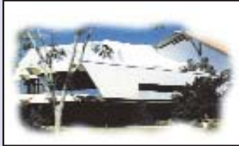
Palacio de Convenciones La Habana