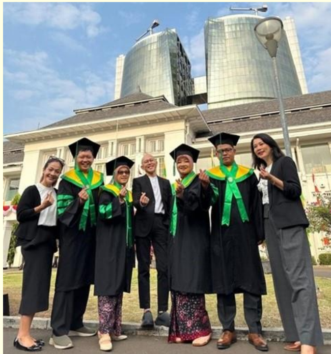
Graduation day of the psychiatry subspecialty residency training at the Faculty of Medicine University of Indonesia

Moreover, the number of psychiatry residency training centers throughout Indonesia may not yet be ready to provide this training because the necessary human resources are still limited. Therefore, a new frontier approach is needed to deliver this training such that general psychiatrists can participate therein even if they stay far away from Jakarta, such as developing a sandwich program or delivering some modules via e-learning. Another potentially helpful solution is guiding other psychiatry residency training centers in Indonesia to deliver subspecialty courses by providing them with supportive resources. Although numerous challenges exist, the opportunities are significantly larger.