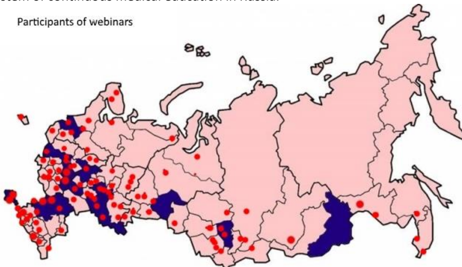
Participants of webinars

In February-April 2018, ECPs' Council Section on web-resources conducted a series of webinars on psychotherapy. Our lecturers were both leading specialists, professors and chairmen of professional psychotherapeutic associations, and young scientists. The webinars were very popular and collected a lot of views online, up to 500 views for each webinar, which are available for free on our website ( http://smu.psychiatr.ru/ ). We have participants from all over Russia. In September 2018 another series of webinars for the rehabilitation of mentally ill patients will be held. Our goal is to include our webinars in the system of continuous medical education in Russia.