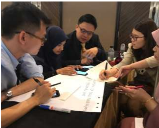
Figure 1 Participants are brainstorming ideas.