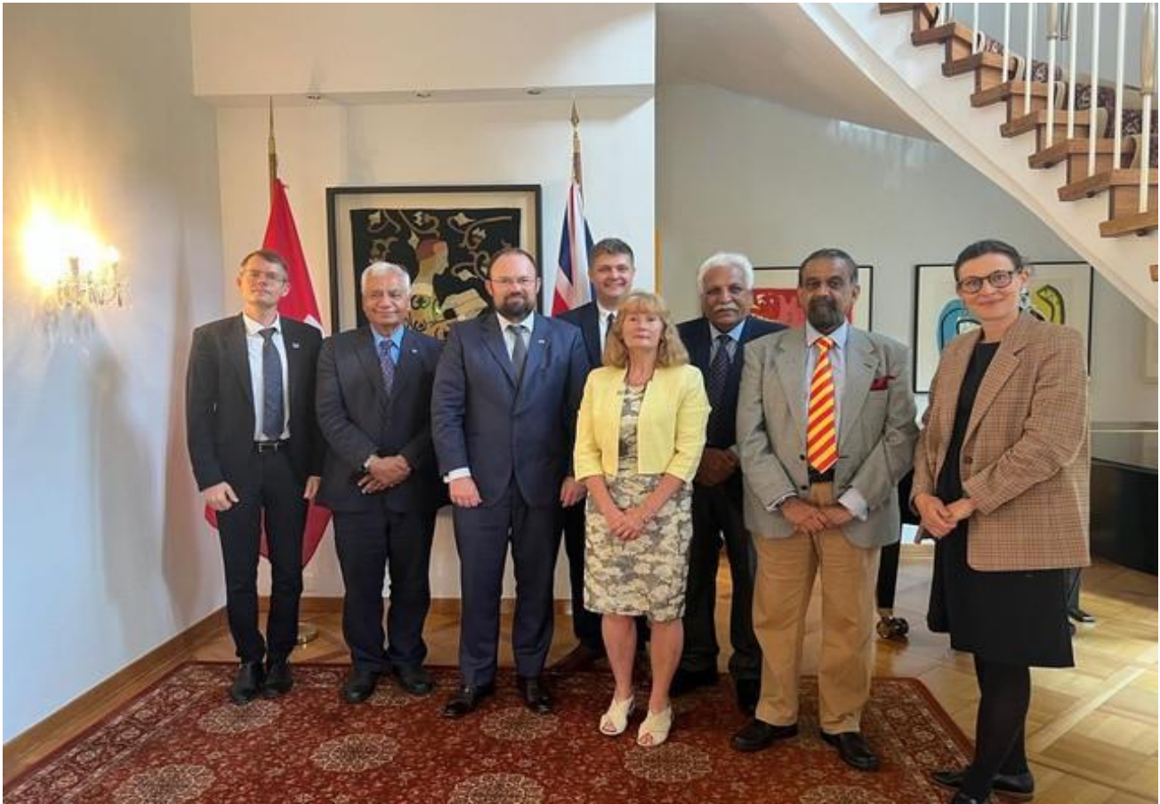
Geopsychiatry Team with British Ambassador Bern, Switzerland