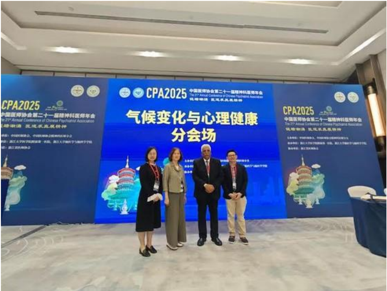
Annual Conference of the Chinese Psychiatrist Association (CPA) on April 10-12, 2025